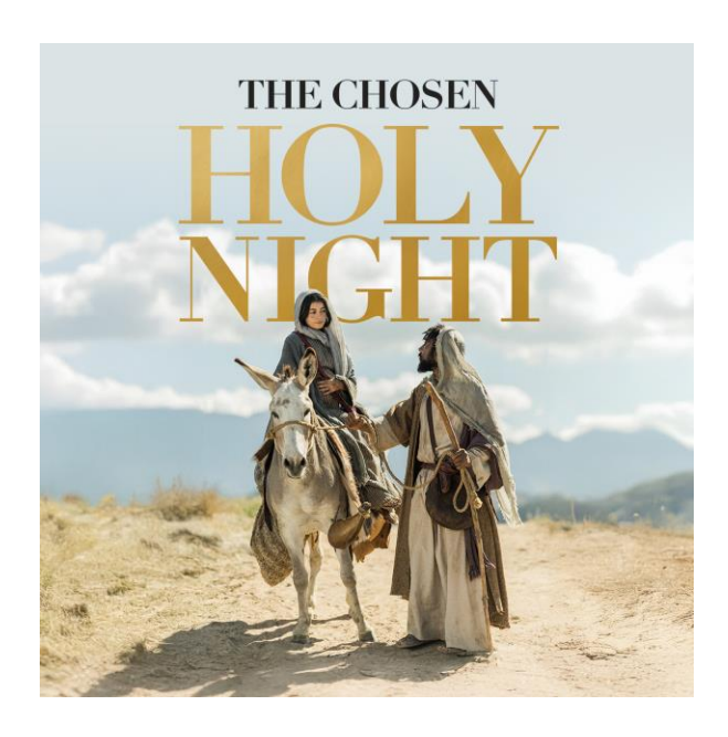
Sunday, December 8 4:30 pm in the Family Life Center

Invite your neighbors, family and friends to come and see!