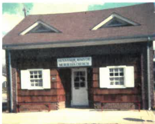
Sunnyside Ministry's first building on Devonshire Street

Today, Sunnyside Ministry provides food, clothing, financial assistance, financial literacy education and scholarships. Serving one out of every four people living in southern Forsyth County.