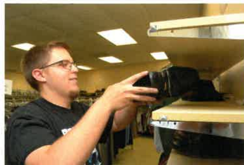
Stocking shoes in Clothing Center

These gifts help insure the ministry the Moravian Church created 45 years ago is able to help our neighbors for the next 45 years.